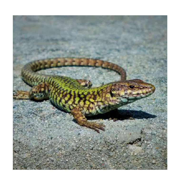
Common wall lizard It is species of lizard with a big distribution in Europe. Prefer rocky environments.