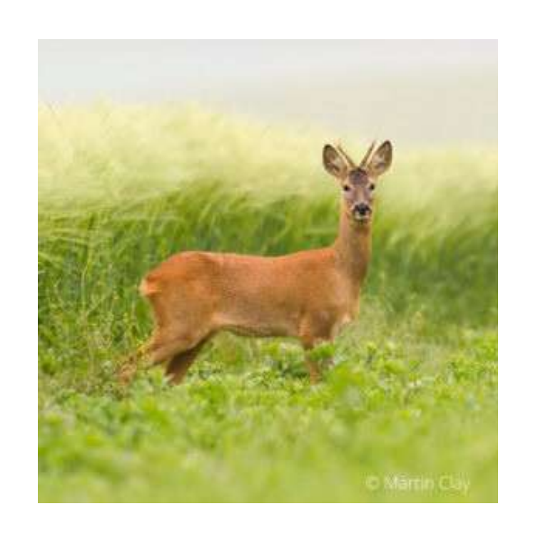
It is a small deer and hebrivore animal.