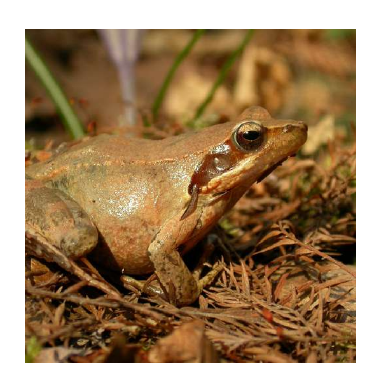
Italian agile frog

It is a wolf-like canid, scavenger animal. Live near villages.